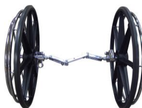
One Arm Drive