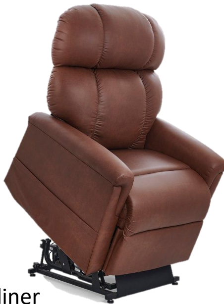
Seat Lift Recliner