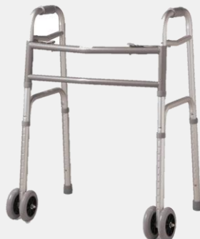
Canes Walkers Rollators