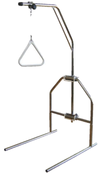
Free Standing Trapeze